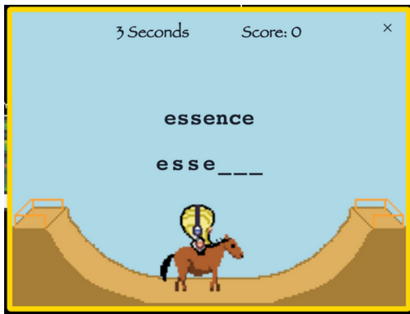
The vehicle trick word-typing game

Our group thought that the movement in Covey.Town was clunky and slow so we decided to introduce the ability for players to equip 3 different types of vehicles at a specified rack: skateboards, bikes, and horses, all with different speeds. Not only did we want users to move around the map faster, but we also wanted to introduce a new activity tied to their vehicles. For this, we built a new vehicle trick game area, where users play a typing-based game and can see their player do tricks when they score points.